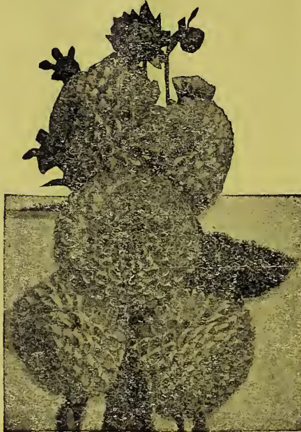
POMPON DAHLIA—Actual Size

DAME FASHION HAS DECREED THAT POMPONS AND THE ENGLISH SINGLE BEDDING DAHLIAS WILL BE USED FOR HOME DECORATION DURING THE NEXT SEVERAL YEARS.